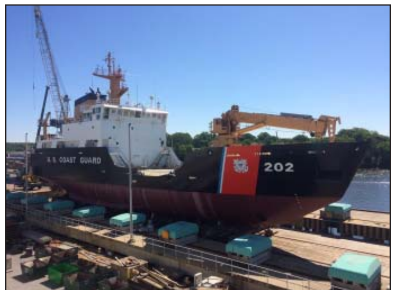
CGC WILLOW (WLB 202) - Newport, RI