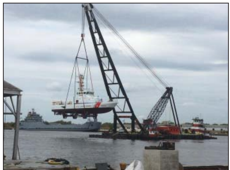
CGC SHRIKE (WPB 87342) - Bayonne, NJ