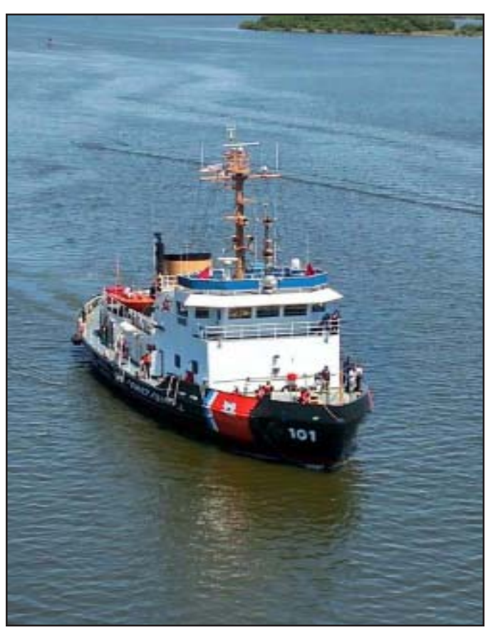
CGC KATMAI BAY (WTGB 101) -Sault Ste. Marie, MI