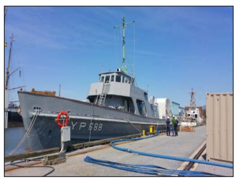
U.S. Navy Yard Patrol (YP 688) - Annapolis, MD