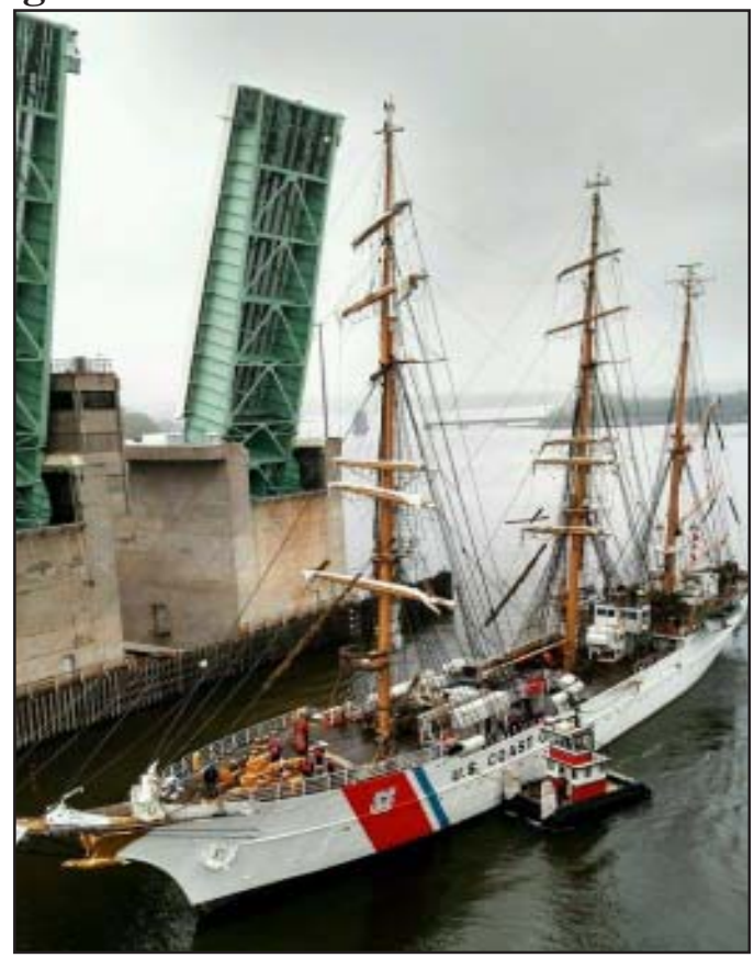
Barque EAGLE (WIX 327) - Baltimore, MD