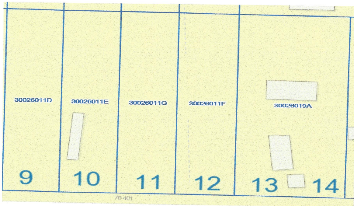
Figure 2. Specific tax parcels included in the Report (that are also shown in figure 1 ).