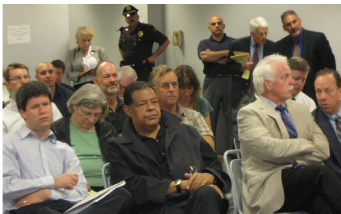
Observers: A conference room at the Powers Building in Providence was crowded on August 27, 2013, when the Rhode Island Division of Taxation held a drawing involving historic preservation tax credits.

letter to submit their applications (technically, Parts 1 and 2) with the Rhode Island Historical Preservation