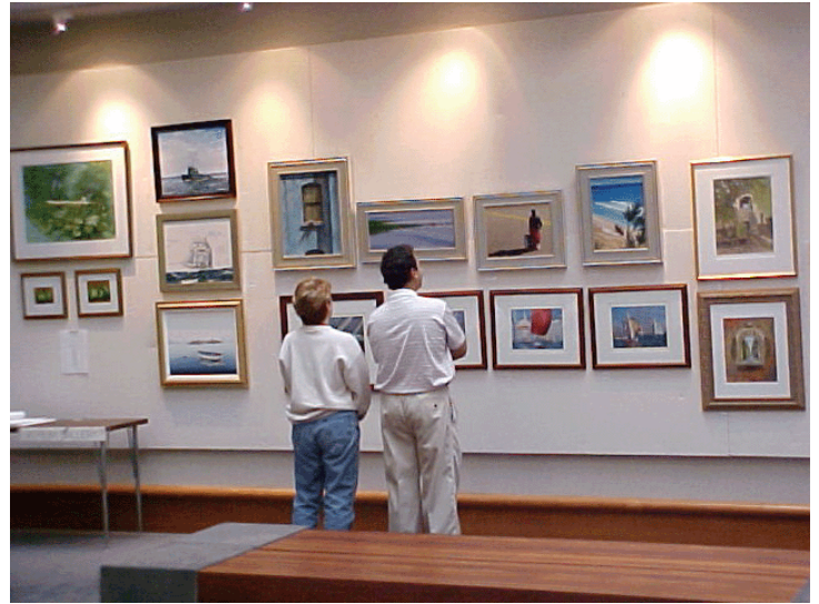
Fine arts: Works of art by current and retired state employees are displayed periodically in the Atrium Gallery (pictured above and below) of the Powers Building in Providence in an exhibit sponsored by the Rhode Island State Council on the Arts