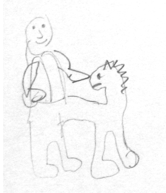
Sketch for Heard of Horses by Evelyn Donnelly

“The elegant aristocrat of old was immersed in this suspension of ashen particles, soaked in it, but the man of today, long used to the electric light, has forgotten that such a darkness existed. It must have been simple for specters to appear in a ‘visible darkness,’ where always something seemed to be flickering and shimmering, a darkness that on occasion held greater terrors than darkness out-of-doors. This was the darkness in which ghosts and monsters were active, and indeed was not the woman who