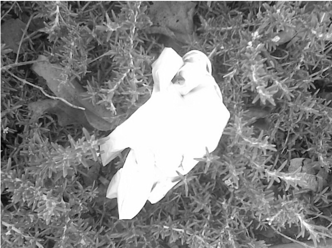
Luminous with sound by Zeynep Bulut

Relative to size, the strongest muscle in the body is the tongue.