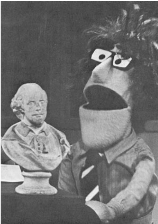
Composer and pianist Don Music, inspiration for David Wightman's Kicking and screaming

Common sites for measuring heart rate include: the thumb side of the wrist, neck, inside of the elbow, under the biceps, groin, middle of dorsum of the foot, behind the knee, over the abdomen, chest, and temple.