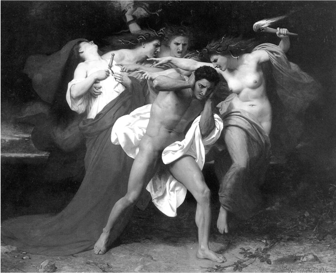
Orestes Pursued by the Furies (1862) from the 19 th -century French painter Adolphe-William Bouguereau, depicting the snake-haired Eumenides castigating Orestes for murdering his mother. Alecto, the same Fury that would later forgive King Oedipus for accidentally killing his father (mentioned by Dryden in his verse for Music for a While ), is shown on the right.