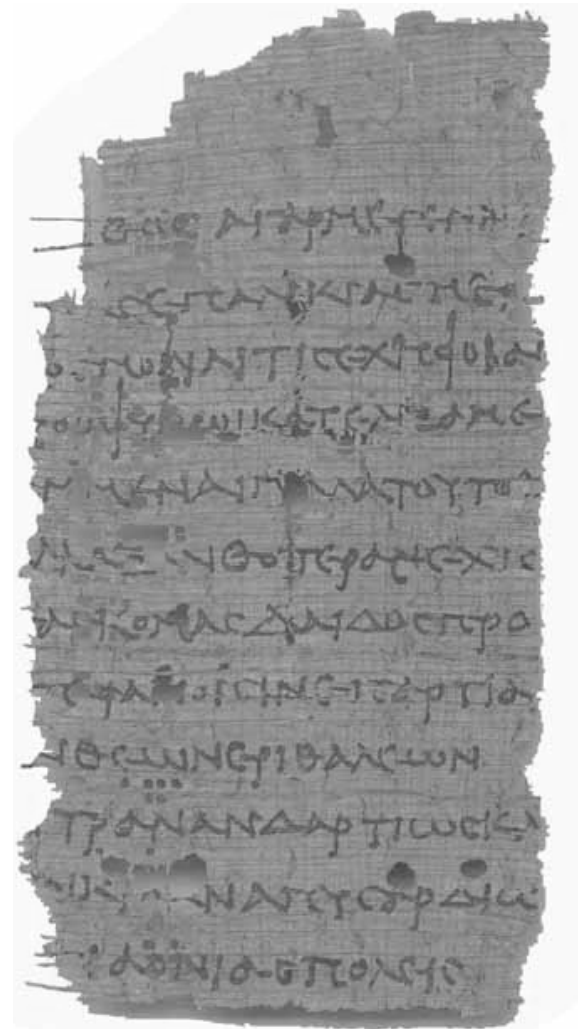
The Copenhagen Sappho-fragment (fr. 98)