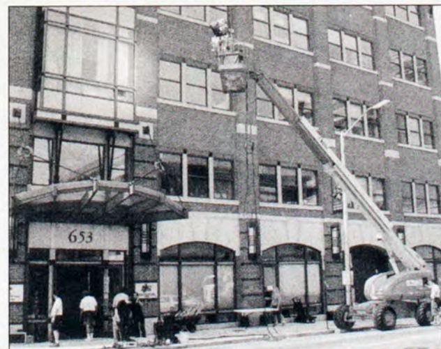
The MIEMSS building on Pratt Street was used as the setting for state offices by HBO's "The Wire," which is shot on location in Baltimore and focuses on the "law" and the drug war.