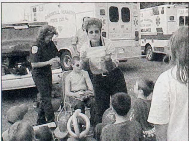
At the Carroll Manor Vol. Fire Co. Safety Day, a young boy is hooked up to a cardiac monitor and the printout from his heart rhythm displayed to a group of children.