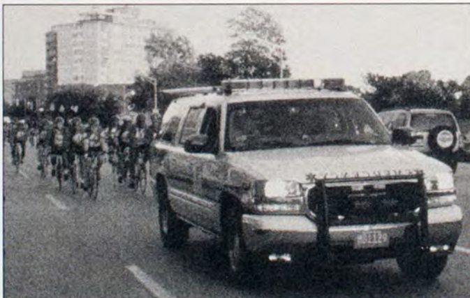
The National Bike Ride "team" arrives in Baltimore.