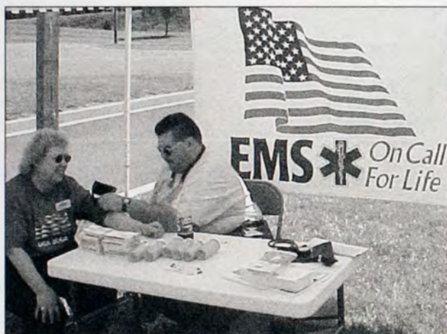
A member of the Emmitsburg Ambulance Co. conducts blood pressure screenings outside the Maryland Welcome Center on US Route 15 in Emmitsburg.