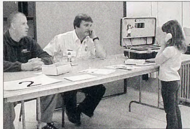
A young girl tries out the 9-1-1 demonstrator at the table of the Guardian Hose Company at the Thurmont Emergency Services Open House.