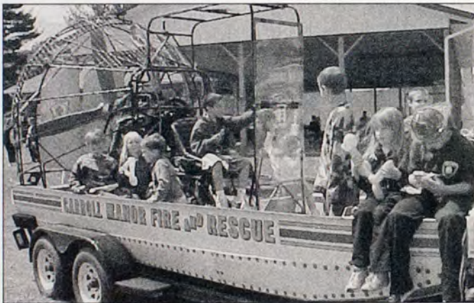
The rescue air boat, on display at the Carroll Manor Vol. Fire Co. Safety Day, is used for rescues in shallow water.