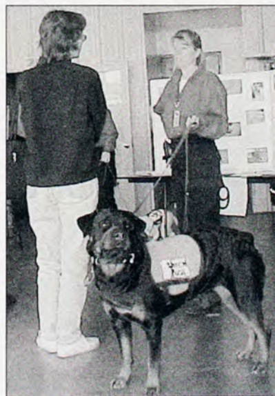
The search and rescue dog team from Thurmont Ambulance Service participated in the Thurmont Emergency Services Open House.