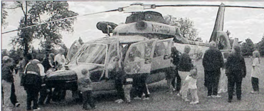
The Maryland State Police Trooper 3 Med-Evac helicopter on display at the Carroll Manor Vol. Fire Co. Safety Day on May 19.