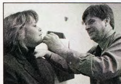
Vaccination with FluMist™.

For further information or if you have difficulty gaining access to either vaccination or Flu Mist™ please contact Lisa Myers at 410-706-4740.