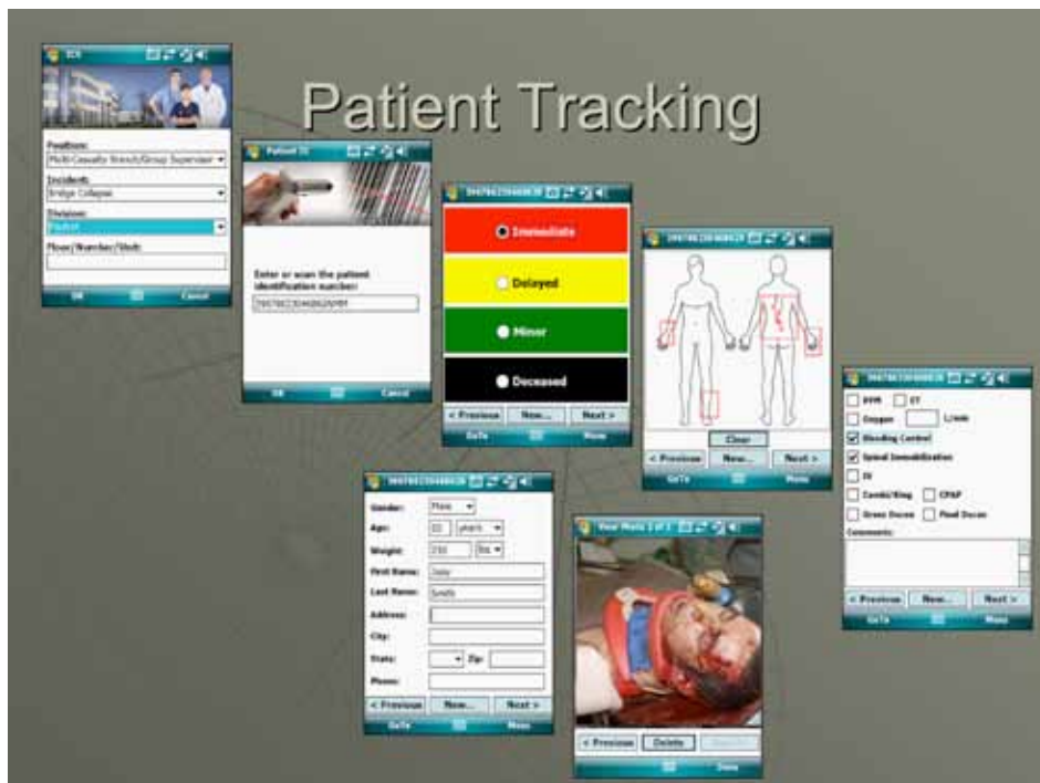
Aspects of the HC Patient Tracking Application.