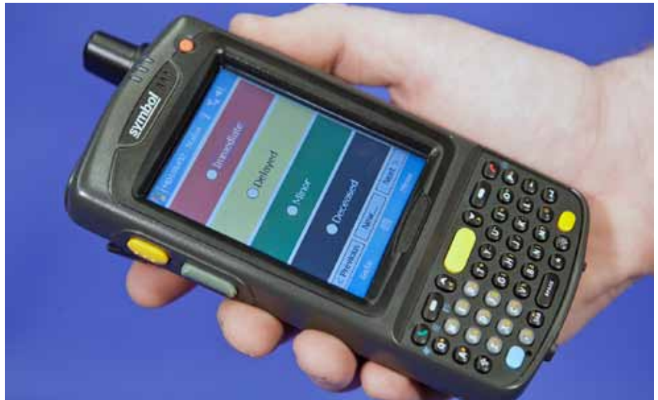
Handheld scanner used in patient tracking.

MIEMSS has accomplished this effort so far through the use of grant funding. The