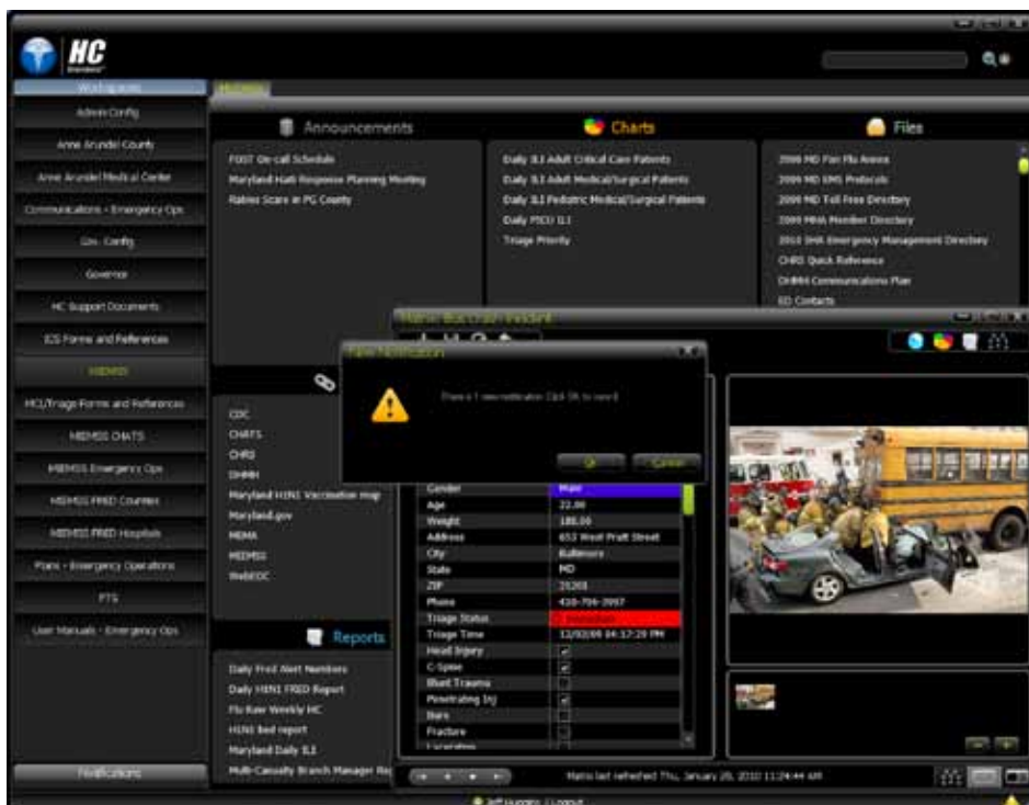
The MIEMSS Emergency Operations Workspace, a sample of many potential customized user workspaces available on HC Standard.