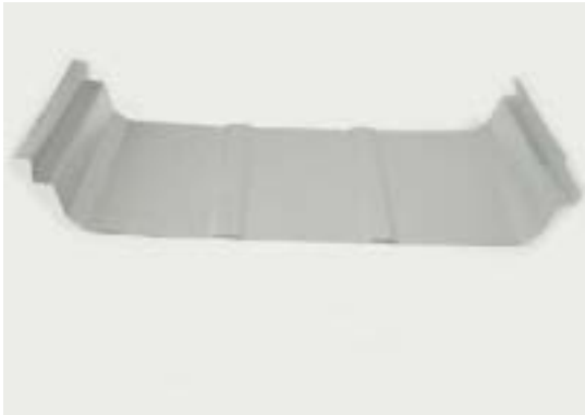
TremLock LSP Profile

TremLock LSP is a trapezoidal standing seam system designed for projects with slopes as low as \frac{1}{4}:12 . This system is best suited for simple sloped roofs without dormers, hips, valleys or other special conditions and can be installed over solid decking or substructural members. TremLock LSP is a field seamed panel.