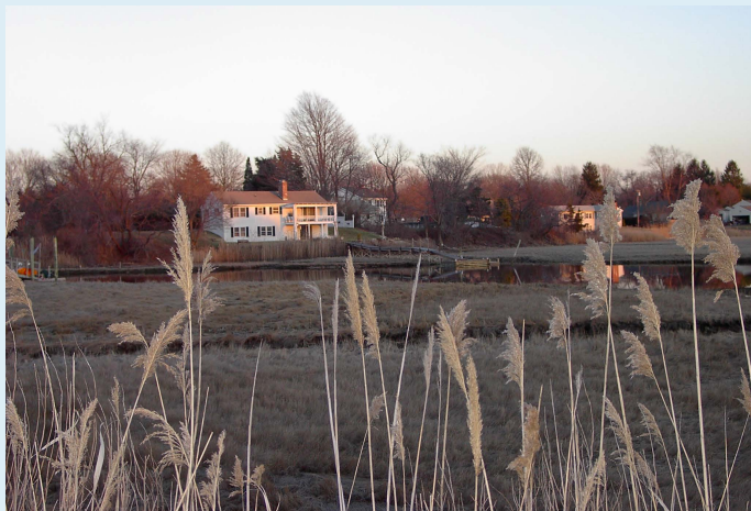
Coastal marshes in Old Saybrook and nearby properties are at risk from sea level rise.

Coastal cities and towns will become more vulnerable to storms in the coming century as sea level rises, shorelines erode, and storm surges become higher. Storms can destroy coastal homes, wash out highways and rail lines, and damage essential communication, energy, and wastewater management infrastructure.