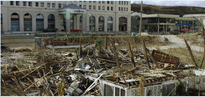
Damage caused by Typhoon Pongsona in 2002.

As the climate changes, typhoons may cause more damage. Guam lies in one of the world's most active regions for tropical storms. In 2002, Typhoon Pongsona caused $700 million in damages, destroyed 1,300 homes, and left the island without power. In just the last few years, neighboring islands have suffered from some of the strongest and most damaging tropical cyclones ever recorded, including Super Typhoons Haiyan (2013), Maysak (2015), and Soudelor (2015). Although warming oceans provide typhoons with more potential energy, scientists are not yet sure whether typhoons have become stronger or more frequent. Nevertheless, wind speeds and rainfall rates during typhoons are likely to increase as the climate continues to warm. Higher wind speeds and the resulting damages can make insurance for wind damage more expensive or difficult to obtain.