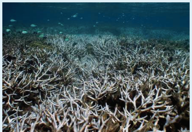
Bleached corals in the Tumon Bay Marine Preserve in 2007.

Warming and acidification could result in widespread damage to marine ecosystems. Guam is home to a diverse array of fish species. Sharks, rays, grouper, snapper, and hundreds of other fish species rely on healthy coral reefs for habitat. Reefs also protect nearshore fish nurseries and feeding grounds. A significant fraction of reef-dwelling fish are likely to lose their habitats by 2100. Increasing acidity would also reduce populations of shellfish and other organisms that depend on minerals in the water to build their skeletons and shells.