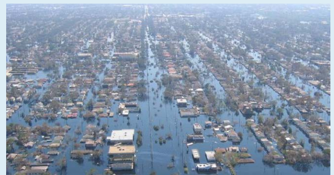
Most of New Orleans was flooded when rising water overtopped levees and floodwalls during Hurricane Katrina in 2005.

Tropical storms and hurricanes have become more intense during the past 20 years. Although warming oceans provide these storms with more potential energy, scientists are not sure whether the recent intensification reflects a long-term trend. Nevertheless, hurricane wind speeds and rainfall rates are likely to increase as the climate continues to warm.