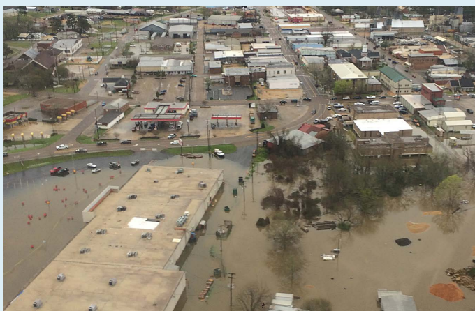
Heavy rains flooded Franklinton in March 2016.

The Port of New Orleans is vulnerable to river floods that shut down traffic on the Mississippi River, as well as coastal storms that can flood port facilities. In 2011, high water levels on the Mississippi River led the U.S. Army Corps of Engineers to divert water through the Morganza Spillway to the Atchafalaya River to prevent serious flooding of Baton Rouge and New Orleans. The resulting high water on the Atchafalaya flooded small towns and about 1,000 square miles of agricultural land, and required temporary levees to protect Morgan City. Although major flooding on the Mississippi River was avoided, high water levels still caused a barge collision that led the Corps to close the river near Baton Rouge for four days.