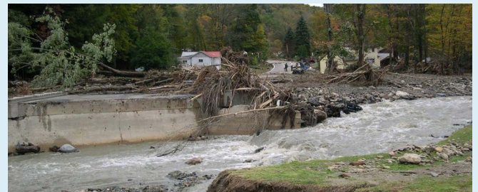
Torrential downpours flooded Alstead and neighboring communities in 2005, causing millions of dollars of damage.

Rising temperatures and shifting rainfall patterns are likely to increase the intensity of both floods and droughts. Average annual precipitation in the Northeast increased 10 percent from 1895 to 2011, and precipitation from extremely heavy storms has increased 70 percent since 1958. During the next century, average annual precipitation and the frequency of heavy downpours are likely to keep rising. Average precipitation is likely to increase during winter and spring, but not change significantly during summer and fall. Rising temperatures will melt snow earlier in spring and increase evaporation, and thereby dry the soil during summer and fall. So flooding is likely to be worse during winter and spring, and droughts worse during summer and fall.