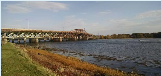
The Great Bay area has marshes and infrastructure that are at risk from sea level rise.

Coastal cities and towns will become more vulnerable to storms in the coming century as sea level rises, shorelines erode, and storm surges become higher. Storms can destroy coastal homes, wash out highways and rail lines, and damage essential communication, energy, and wastewater management infrastructure.