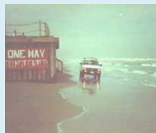
An eroded beach on North Padre Island impairs public access along the shore.

Tropical storms and hurricanes have become more intense during the past 20 years. Although warming oceans provide these storms with more potential energy, scientists are not sure whether the recent intensification reflects a long-term trend. Nevertheless, hurricane wind speeds and rainfall rates are likely to increase as the climate continues to warm.