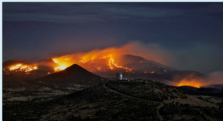
The 2011 drought contributed to widespread wildfires in Texas, like this one behind the McDonald Observatory near Fort Davis.

The combination of more fires and drier conditions may expand deserts and otherwise change parts of the Texas landscape. Many plants and animals living in arid lands are already near the limits of what they can tolerate. A warmer and drier climate would generally extend the Chihuahuan desert to higher elevations and expand its geographic range. In some cases, native vegetation may persist and delay or prevent expansion of the desert. In other cases, fires or livestock grazing may accelerate the conversion of grassland to desert in response to the changing climate. For similar reasons, some forests may change to desert or grassland.