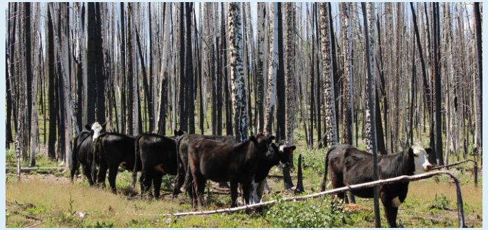
Cattle grazing after the 2012 Fontenelle Fire west of Big Piney.

Higher temperatures and drought are likely to increase the severity, frequency, and extent of wildfires in Wyoming, which could harm property, livelihoods, and human health. On average, about 1.4 percent of the land in the state has burned per decade since 1984. Wildfire smoke pollutes the air and can increase medical visits for chest pains, respiratory problems, and heart problems.