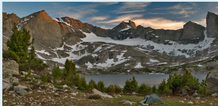
An unnamed glacier in the Wind River Range, along with some snowpack that has persisted into the summer.

Wyoming's mountain ranges also contain 1,500 glaciers. As the climate warms, most of these glaciers will retreat and some could disappear altogether. Areas that are no longer covered by glaciers may still accumulate snowpack, but the snow will no longer remain year-round.