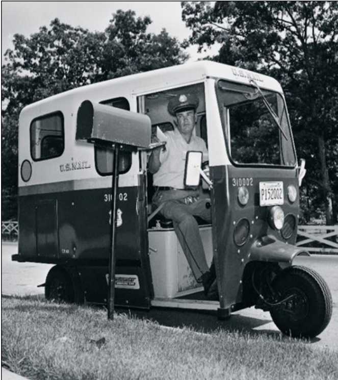
Several of the letter carriers recalled using Mailsters, like the one pictured here in 1964.

things that they tried, you know, didn't work. They had a thing called a Mailster. It didn't work, it would turn over and stuff. But the first that everybody had was these little Chevettes."