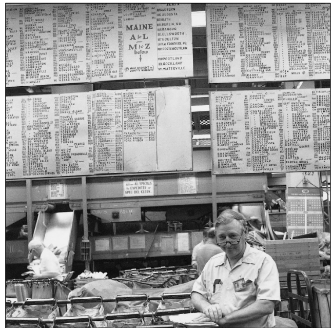
Learning the scheme required clerks to memorize hundreds of address elements.