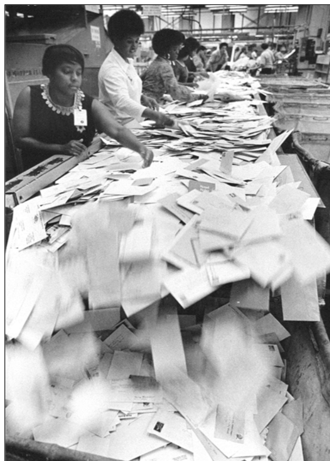
In the 1960s increasing numbers of women entered the postal workforce.