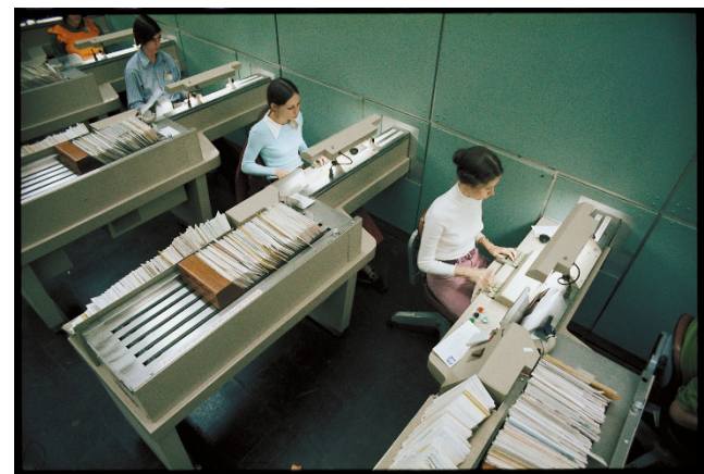
Letter sorting machines became more widespread in the early 1970s.

Dial also recalled how the LSM boosted productivity: "On the LSM there were 12 key-in consoles. We used little piano-style keyboards, to key-in mail codes to sort the mail. And we were trained to key that mail at one piece per second, 60 a minute. That meant with all things being perfect, one person could key 3,600 pieces of mail an hour. That was quite significant—all things being perfect. But then, of course there was a high error rate, there were machine malfunctions, and that cut into productivity. But again, on paper, 3,600 pieces of