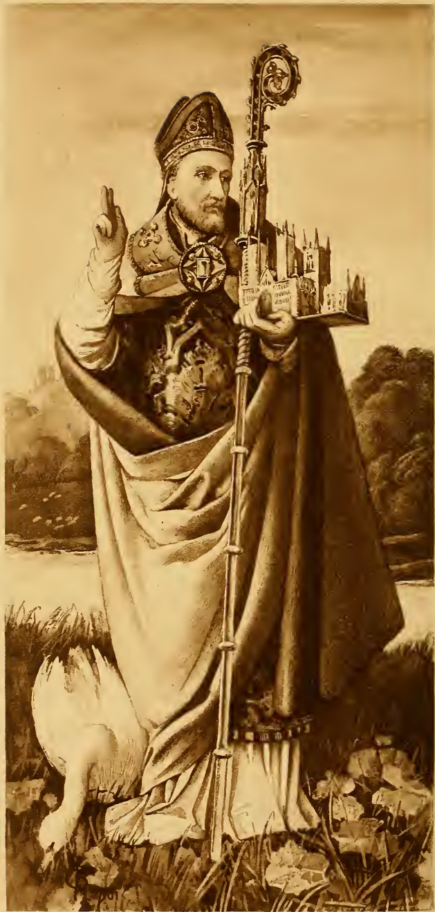
Hugh of Lincoln.