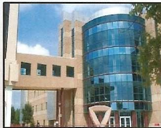
Science Laboratory Building