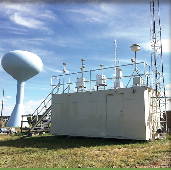
Ambient air quality monitoring stations are located throughout the state.

The Division of Air Quality is responsible for protecting North Dakota's air quality. Scientists, engineers and technicians oversee permitting and compliance of state and federal program requirements. The division maintains federal delegation of responsibility for U.S. Environmental Protection Agency (EPA) programs and provides technical assistance on environmental matters and during emergency response efforts. In addition, industry is regulated with the issuance of permits that include specific emission limits to ensure proper operations and clean air. Division staff work proactively with industry to address emissions as well as citizen concerns and complaints.