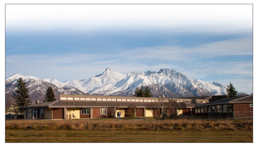
Alaska Veterans & Pioneers Home (Palmer)

The originally named Palmer Pioneer Home first opened in 1971 on the former site of the Alaska State Fairgrounds. Nestled in the heart of downtown Palmer, the home is surrounded by beautiful views of the Chugach and Talkeetna Mountain Ranges, as well as, the massive Knik Glacier. In May 2004, the Alaska Legislature approved development of the state's first veterans' home. After extensive remodeling and program development to meet U.S. Department of Veterans Affairs requirements, the facility was renamed the Alaska Veterans and Pioneers Home in 2007. Seventy five percent of the 79 beds in the home are designated for veterans, and 25 percent are available for non-veterans.