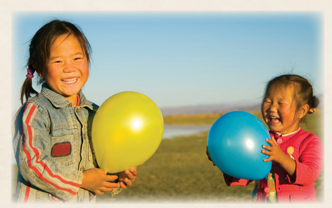
Working Together For Alaska's Children In Care