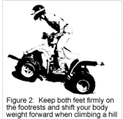
Figure 2. Keep both feet firmly on the footrests and shift your body weight forward when climbing a hill