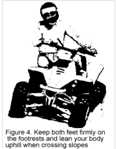
Figure 4. Keep both feet firmly on the footrests and lean your body uphill when crossing slopes

Begin the braking process by releasing the throttle and shifting to a lower gear well in advance of the intended stopping point. With this method, the engine helps to slow your ATV. Applying brakes smoothly and evenly will bring your ATV to its quickest stop. Apply brakes lightly on slippery surfaces. When descending a hill, shift to a lower gear for engine braking rather than riding the brakes for an extended period of time.