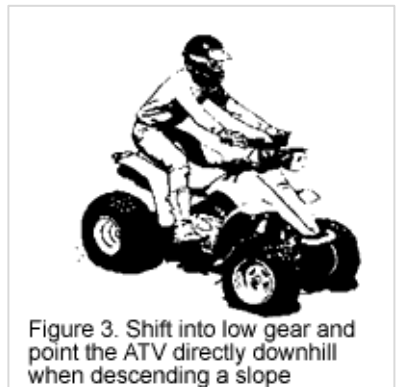
Figure 3. Shift into low gear and point the ATV directly downhill when descending a slope

Rigid mount equipment is usually bolted to the front or rear of the machine and includes luggage racks to transport feed or supplies, broadcast seeders, and wick applicators for chemical weed control. This type of mounting places the entire weight burden on your ATV. You should realize that this will have a significant impact on the weight and balance of your machine. The center of gravity may be moved