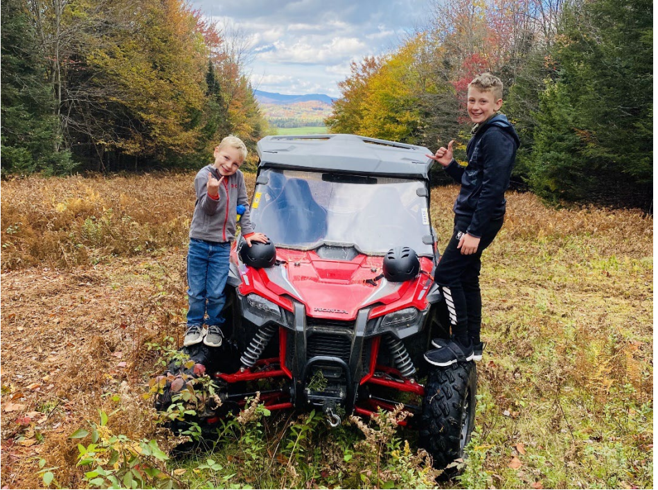
Troy, Vermont