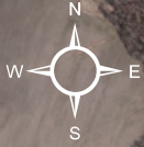
Exhibit A Henderson Agricultural Lease Monocacy Natural Resource Management Area (3 Year Lease Cycle)

Note: 1) An updated Soil and Water Quality Plan with the Montgomery County Soil Conservation District will be required. DNR will initiate this process during the lease period. The Tenant will be responsible for implementation of identified conservation practices. 2) Portions of the fields or all of the fields identified by the striped areas may be removed by Landlord from the leased Premises for conservation by the State. Appropriate notice will be made to the Tenant as provided in Section 8f of the Lease. 3) Multi species cover crop and reduced tillage are required in all fields.