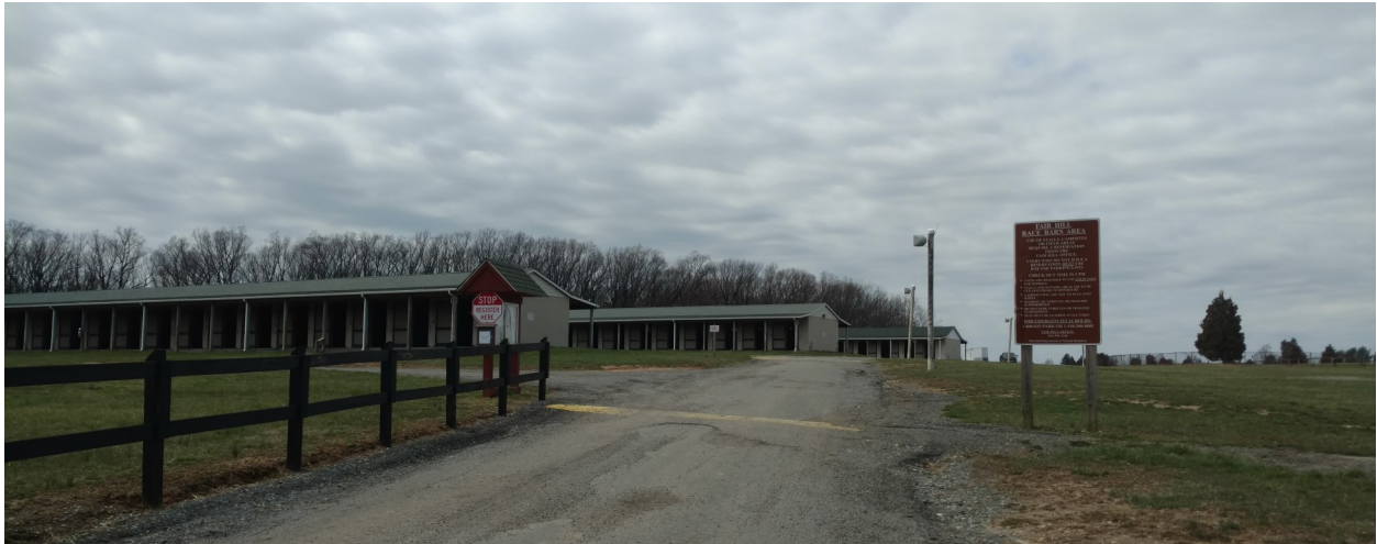
Equestrian Camping Entrance