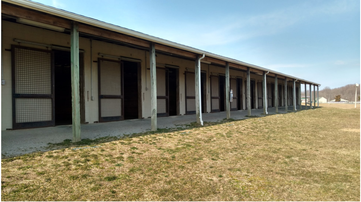
Barn with Stalls