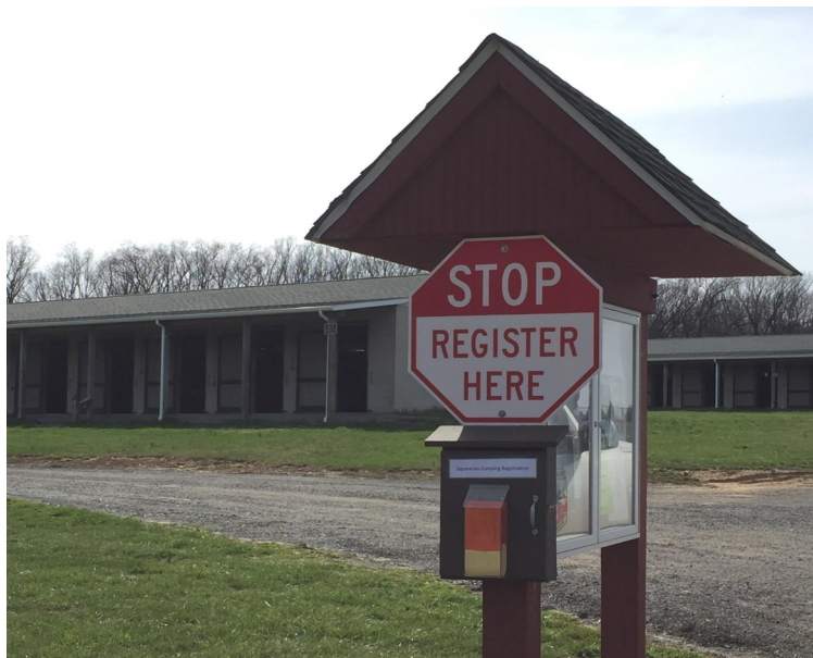
Equestrian Camping Self-Registration Kiosk