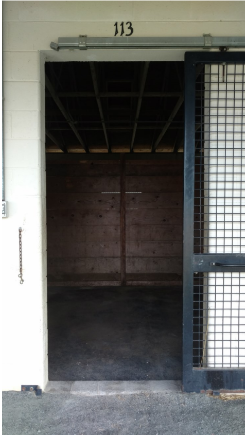
10'x 10' Box Stall with Rubber Matting $15.00 per Night per Stall