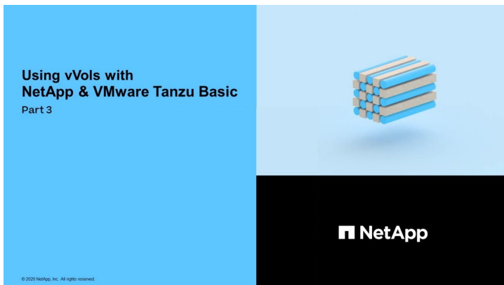
How to use vVols with NetApp and VMware Tanzu Basic, part 3