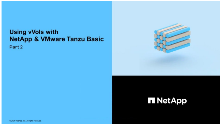
How to use vVols with NetApp and VMware Tanzu Basic, part 2