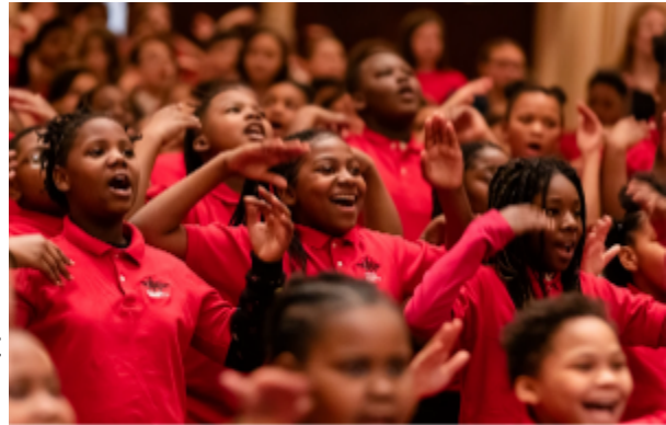
Black History Month Virtual Concert

"Black History Month Virtual Concert: Preserving and Persevering explores how the power of Black music has been the cultural key in both preserving African traditions in America and in helping millions persevere in the face of racial injustice. The dynamic virtual educational program features powerful performances by CCC singers and GRAMMY Award-winning guest artists Lisa Fischer and Ranky Tanky following a behind-the-scenes pre-show of the educational experience leading up to the virtual event."