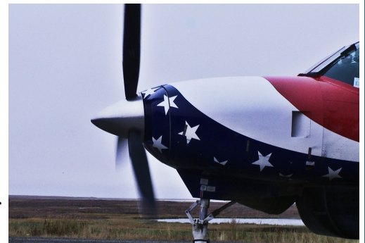
Aviation, the only year-round transportation system for America’s most remote residents.

Continued investment in aviation is critical to keeping rural Alaskans connected and preserving their lifeline.