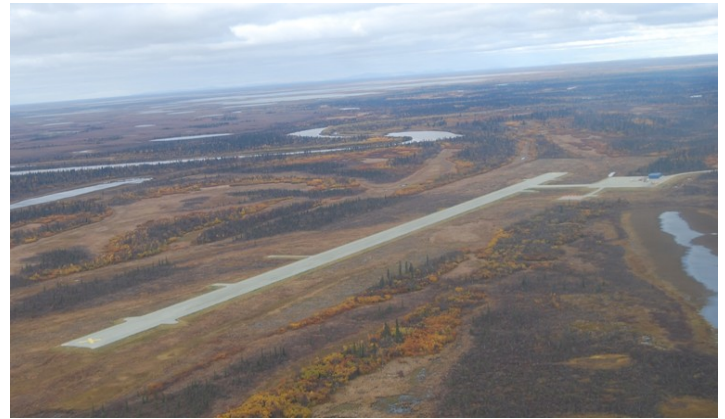
New airport for the isolated and remote community of Akiachak

The population of rural Alaska is primarily Native Alaskan. The remote, starkly beautiful land that we refer to as “rural Alaska” is simply “home” to the people who have inhabited the state for