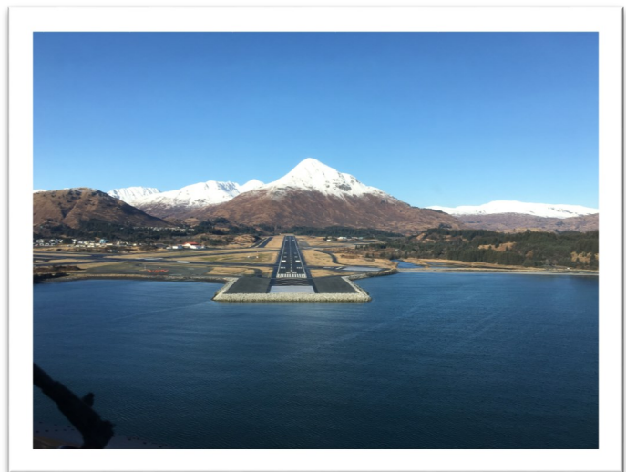
Kodiak Airport - RSA extended into the Gulf of Alaska.

DOT&PF owns and operates seven airports on Kodiak Island - Port Lions, Ouzinkie, Larsen Bay, Karluk, Old Harbor, Akhiok, and Kodiak. A $59 million project was completed in 2015, that extended the runway safety areas (RSA) for two runways at the Kodiak Airport by building into the tumultuous Gulf of Alaska. Contractors moved an estimated 1.1 million tons of rock to fill a portion of the Gulf of Alaska in order to create enough surface area for an engineered material arresting system (EMAS) on one runway and to lengthen another runway to allow for an EMAS bed on its other end.