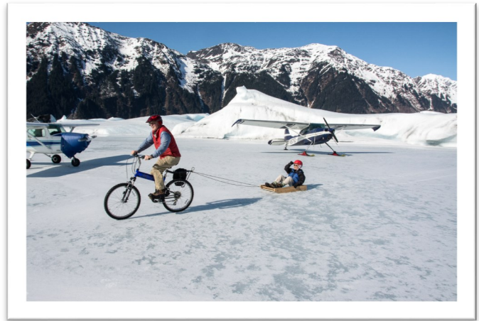
Big Johnstone Lake east of Seward is a popular destination for a spring getaway. Throw in two folding bicycles, a wooden sled, and off you go!

At some of the state's larger general aviation airports such as, Lake Hood Seaplane Base " the busiest seaplane base in the world " and the Talkeetna Airport, springtime means getting ready for the thousands of tourists flying out of them to view Alaska's wilderness, heading out on fishing trips, and visiting numerous back country destinations.