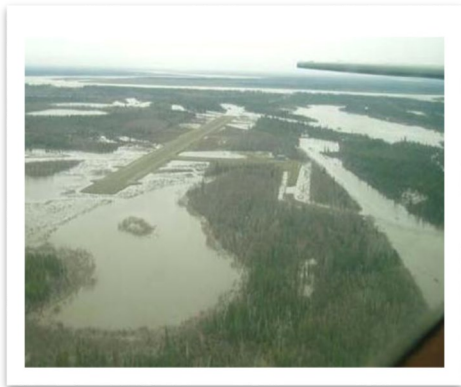
Stevens Village runway is the high spot during spring flooding.

For runways in rural Alaska, springtime brings challenging conditions where ice jams and flooding are annual occurrences. Once the ice is gone, gravel and other supplies can be barged or flown in and DOT&PF airport staff travel to remote airports to perform critical maintenance and repair tasks. They often work long days that end with them camping overnight in the airport's equipment storage building which has no facilities or running water. The resourcefulness of the staff to maintain the rural airports under extremely challenging conditions, with minimal support and resources, is accomplished because they are committed to their jobs and know the communities depend on their airports - their village lifeline.