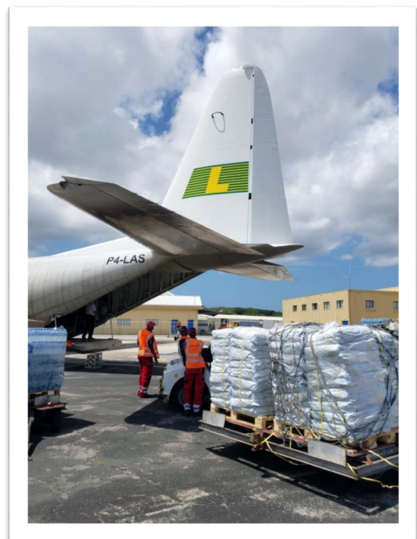
LAC Hercules delivers supplies to St. Martin after the devastation of hurricanes last September.

A new program at the Ted Stevens Anchorage International Airport is providing stress relief for travelers and bringing much joy to animal lovers. The National Crisis Response Canines organization is all about dogs helping people. They are trained to provide safe compassionate support to people effected by crisis or when someone is hurting. The canine teams are specially trained and are distinguished by the purple tops they wear. Please say "hi" next time you are at the airport!