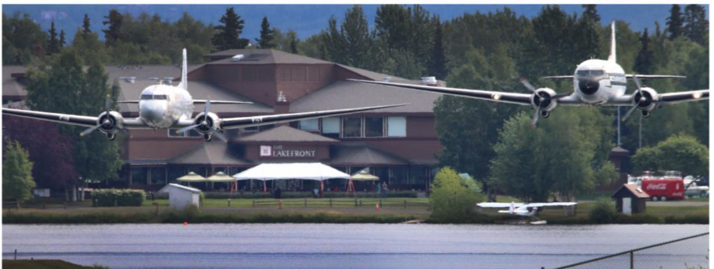
Desert Air's DC3's doing a flyby at this year's Aviation Festival