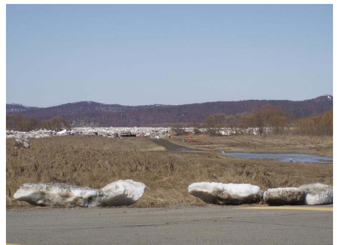
River ice on the runway