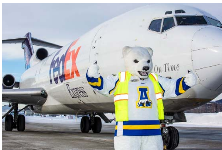
UAF's mascot Nanook guides the FedEx 727 to the terminal at Fairbanks International Airport.