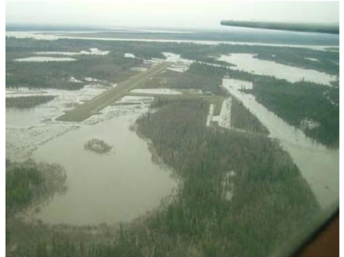
Stevens Village new runway is the high spot during flooding.