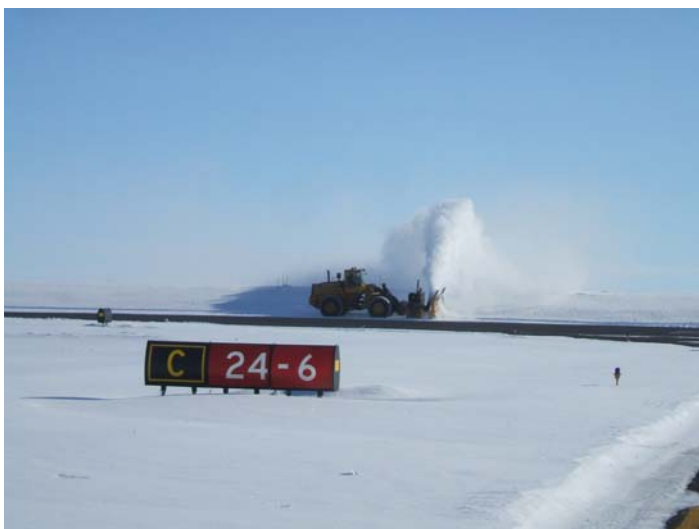
Snow removal in action at the Barrow Airport!