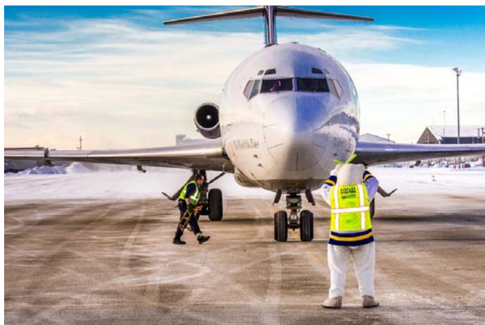
UAF's new cargo jet will be parked at UAF CTC's hangar located on the East Ramp of Fairbanks International Airport.

UAF CTC will host an open house of its new facility at Fairbanks International Airport on May 1st at 4:30pm. For more information call 907/455-2809. The University of Alaska system consists of three hubs—University of Alaska Anchorage, University of Alaska Fairbanks, and University of Alaska Southeast. System-wide, offering 500 degree, certificate or endorsement programs. For more information on the UAA and UAF aviation programs visit www.uaa.alaska.edu/ctc or www.ctc.uaf.edu