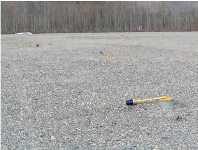
Effects of flooding - damaged runway lights

Springtime brings warmer weather and also challenging conditions for the department's maintenance and operations crews. Ice jams and flooding are annual occurrences at Alaska's rural airports. Once the ice is gone, gravel and other supplies can be barged or flown in and DOT&PF airport staff travel to remote airports to perform critical maintenance and repair tasks. They often work long days that end with them camping overnight in the airport's equipment storage building which has no facilities or running water. The resourcefulness of the staff to maintain the rural airports under extremely challenging conditions with minimal support and resources is accomplished because they are committed to their jobs and know the communities depend on their airports - the village lifeline.