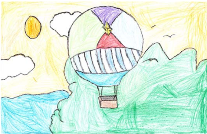
First place winner in the Junior Division