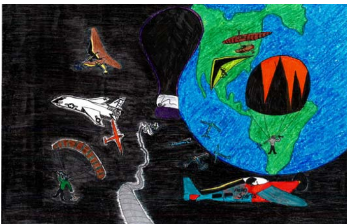
First place winner in the Intermediate Division