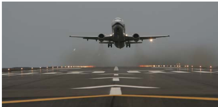
Alaska Airlines jet departing from Barrow Airport. Runway and apron paving project completed in 2010.

ADOT&PF began updating the master plan for the airport in December 2012. The purpose of this project is to evaluate the use, role, and impact of the Barrow Airport in supporting aviation and the local economy, and to promote efficient, orderly improvements to airport facilities. Details about the airport master plan process and opportunities for public input can be found at: www.dot.alaska.gov/nreg/barrowmp .