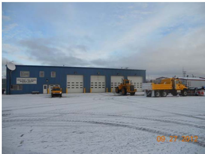
DOT&PF’s snow removal equipment building also used for storage of deicing chemicals and application equipment.