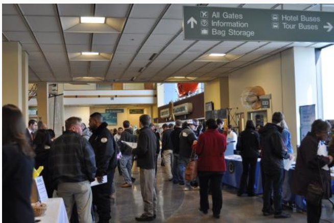
ANC North Terminal Job Fair No cost to attend and Free Parking!

The Alaska Department of Labor and Workforce Development has information online about Job Fairs around the state, company recruitments, and workshops.