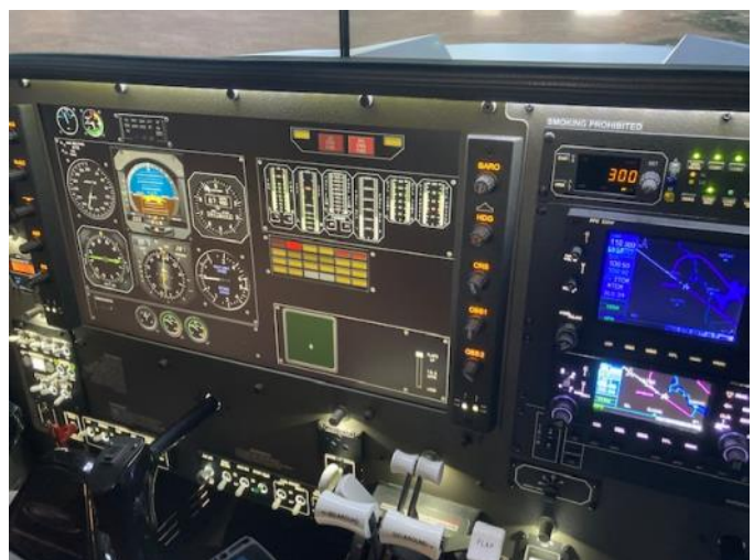
Citation 550 Jet Simulator

All GA piston drivers and CFIs are strongly encouraged to contact one of the airport's many flights schools possessing AATDs. All can be found on the Merrill Field website and will be given first right of refusal.