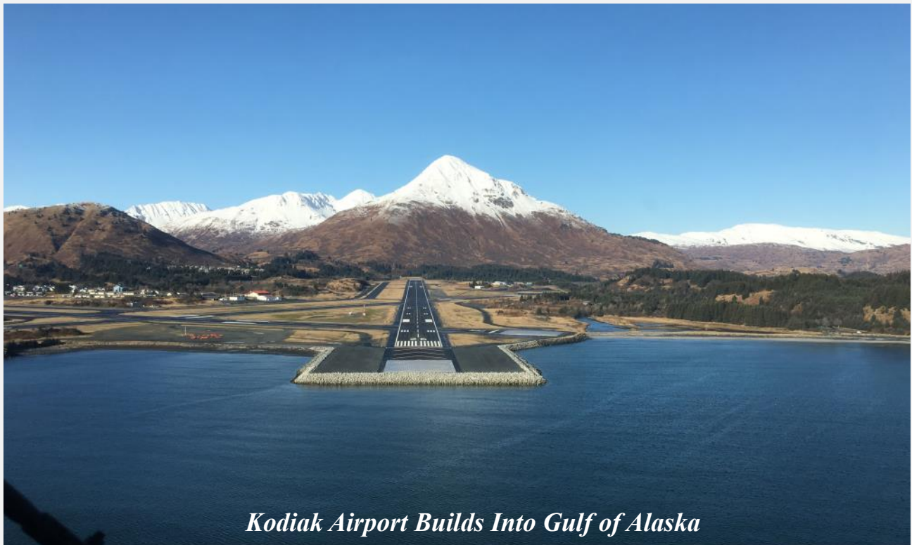
Kodiak Airport Builds Into Gulf of Alaska