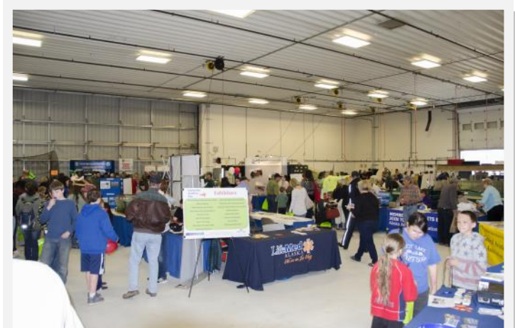
Record crowds attend Fairbanks Aviation Day