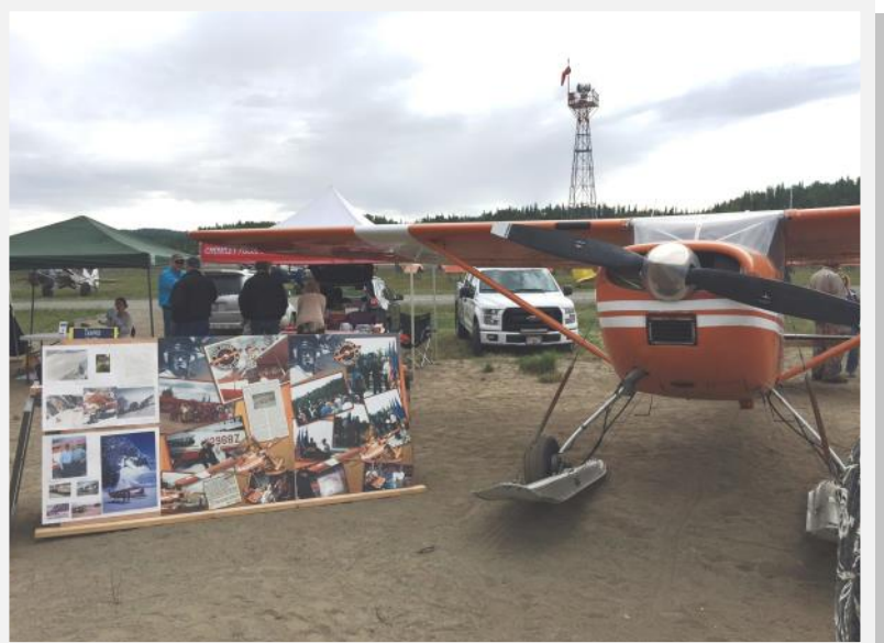
The Hudson Memorial Fly-In celebrated its 6th year with over 100 aircraft participating in a Poker Run, Aerial Scavenger Hunt, Take-off and Landing Demonstrations, and free flights for kids.