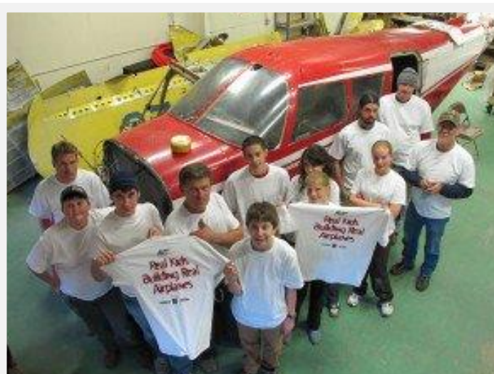
Real Kids..... Building Real Airplanes!

(Thanks to Angie Slingluff for story and photos)