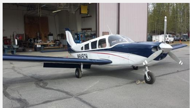
Before and After Photos of Cherokee N645CH!