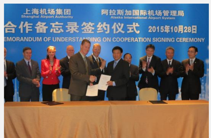
Memorandum of Understanding signing between the Alaska International Airport System and the Shanghai Airport Authority.