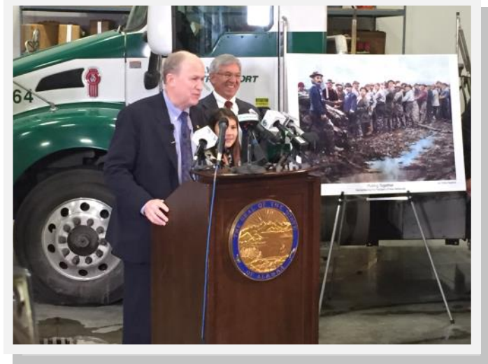
Governor Bill Walker and Lt. Governor Mallott presented the New Sustainable Alaska Plan at the Lynden Hangar at Ted Stevens Anchorage International Airport. For more information on the 2017 state budget - https://www.omb.alaska.gov/index.php