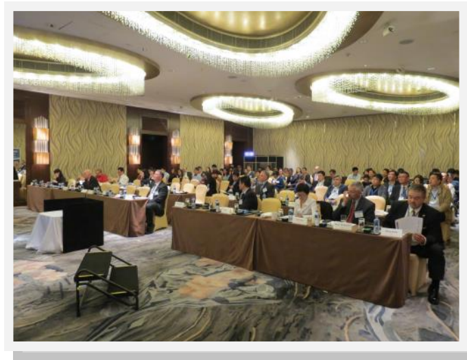
International airline executives and freight forwarders including the US Air Forwarders Association and the Shanghai Freight Forwarders Association participated in the Air Cargo Summit held in Shanghai.

The AIAS trip was an incredible success, bringing together approximately 75 aviation and freight forwarding business professionals and developing a lasting relationship with the Shanghai Airport Authority.