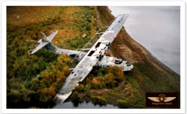
Queen of Dago Lake

Service from San Francisco will operate Tuesday, Thursday and Saturday departing at 7:51 p.m. arriving in Fairbanks at 11:56 p.m. and will depart FAI Wednesday, Friday and Sunday at 12:47 a.m. arriving in San Francisco at 6:42 a.m. The route will begin June 6 and operate through Aug.18, 2019.