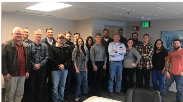
AAAE's Certified Member Academy Class Participants from DOT&PF and airports across the state spent five days in an intensive training class focused on comprehensive airport management.