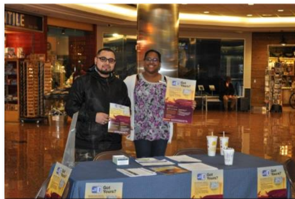
Alaska DMV staff at the Ted Stevens Anchorage International Airport reminding travelers of the upcoming REAL ID requirement.

Beginning in October 2020, travelers will need a federally compliant Real ID or their passport to board commercial flights. Details here . The DMV encourages residents to get their Alaska Real ID soon since lines will be getting longer and longer.