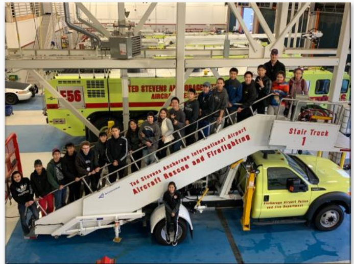
Students from the Lower Yukon School District, Kusilvak Career Academy receive a tour and briefing from the Airport Police & Fire Department at Ted Stevens Anchorage International Airport.