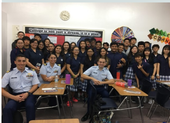
FAPAC-USCG members visit potential recruits at Grace Christian Academy School in Navy Hill, Saipan.