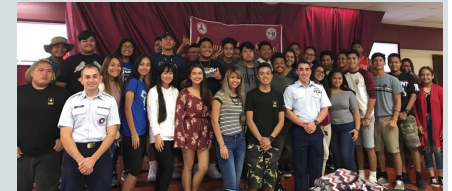
Students at Kagman High School, Kagman, Saipan, pose with FAPAC-USCG members at recruitment event.