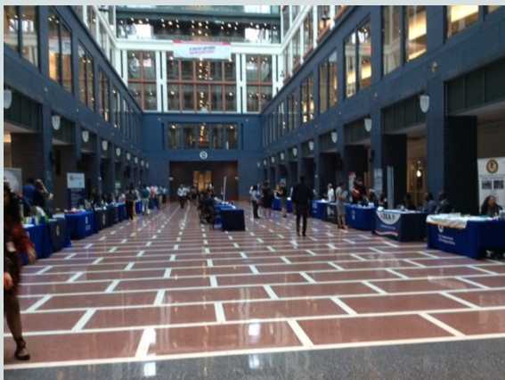
Exhibit booths and participants at the FAPAC Federal Employment Career Fair at US DOT Headquarters.

On Friday September 21, 2018, the Federal Asian Pacific American Council (FAPAC) conducted a Federal Career Fair for students. Our host was the United States Department of Transportation (DOT) in Washington, D.C.