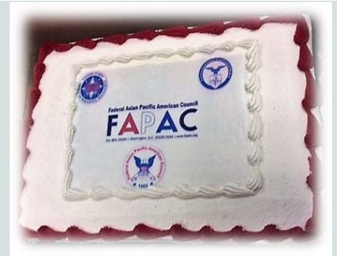
Delicious cake enjoyed by participants at FAPAC-OPM Chapter Inauguration on August 30th.