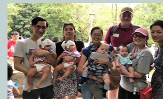
Future leaders of FAPAC with their parents and other family members.

The FAPAC 2018 Potluck Picnic was held at the Potomac Overlook Regional Park in Arlington, Virginia on August 25, 2018. A crowd of over 200 FAPAC members and their families enjoyed the day's activities, delicious food and the opportunity to mingle and network with their FAPAC friends.