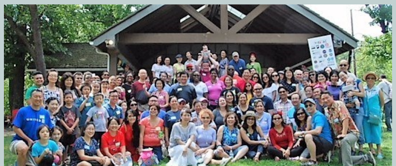
Over 200 attendees at the FAPAC 2018 Potluck Picnic had an enjoyable, relaxing opportunity to mingle with friends and family.