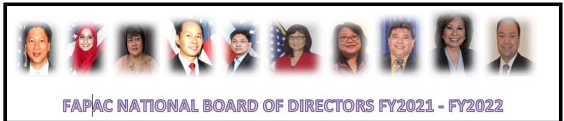
FAPAC NATIONAL BOARD OF DIRECTORS FY2021 - FY2022

FAPAC has evolved into a premier organization and I will continue to be part the team to meet our mission statement and continue to support Asian Americans Pacific Islanders (AAPIs) in government.