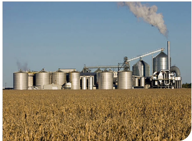
The ecoFuels Netherlands BV, a part of the Bio Oil Group, converts used cooking oil into high-quality biodiesel fuel.

Burning it to run cars, trucks, buses and trains releases 80% less carbon dioxide (CO 2 ) compared to fossil diesel.