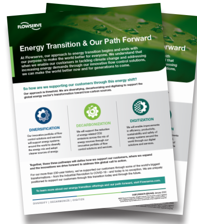
Read Flowserve’s approach to energy transition .

Flowserve Corporation 5215 North O’Connor Blvd. Suite 700 Irving, Texas 75039-5421 USA Telephone: +1 937 890 5839