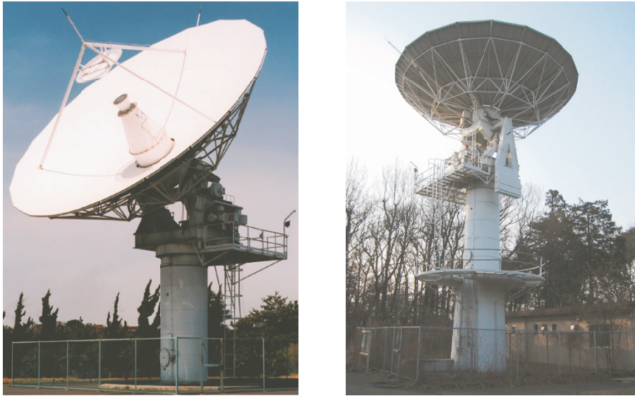
Figure 2. 11-m VLBI antennas at Kashima (left) and Koganei (right).

11-m antenna and other VLBI facilities at Miura and Tateyama stations have been transported to Tomakomai Experimental Forest of the Hokkaido University and to the campus of Gifu University, respectively. As a consequence, two 11-m stations at Kashima and Koganei (Figure 2) are remaining as IVS Network Stations. After the regular VLBI sessions with the Key Stone Project VLBI Network terminated in 2001, 11-m VLBI stations at Kashima and Koganei are mainly used for the purposes of technical developments and miscellaneous observations.