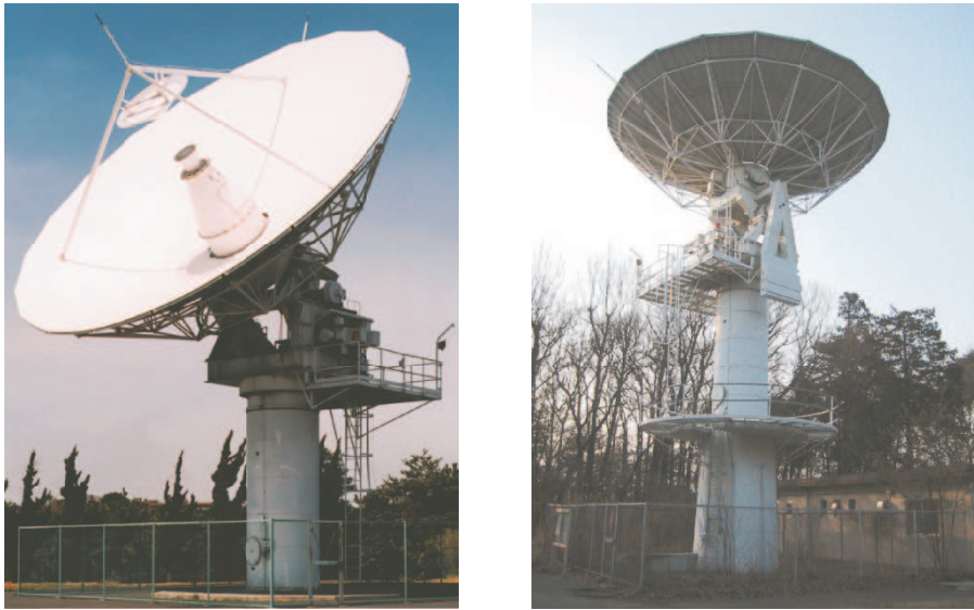
Figure 2. 11-m VLBI antennas at Kashima (left) and Koganei (right).

The 11-m antennas and other VLBI facilities at Miura and Tateyama stations have been transported to Tomakomai Experimental Forest of the Hokkaido University and to the campus of Gifu University, respectively. As a consequence, two 11-m stations at Kashima and Koganei (Figure 2) are remaining as IVS Network Stations. After the regular VLBI sessions with the Key Stone Project VLBI Network terminated in 2001, 11-m VLBI stations at Kashima and Koganei are mainly used for the purposes of technical developments and miscellaneous observations.