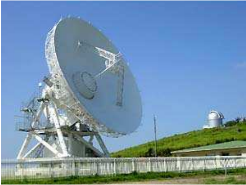
Figure 1. VERA Iriki antenna (foreground)