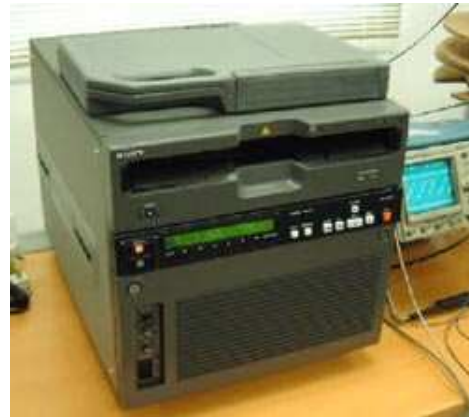
Figure 3. DIR2000: 1 Gbps recorder used in VERA operations.