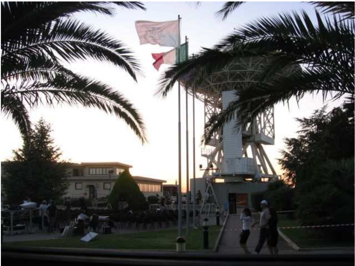
Figure 1. The Matera “Centro di Geodesia Spaziale” (CGS).

The Matera VLBI station is located at the Italian Space Agency’s ‘Centro di Geodesia Spaziale G. Colombo’ (CGS) near Matera, a small town in the south of Italy. The CGS came into operation in 1983 when the Satellite Laser Ranging SAO-1 System was installed at CGS. Fully integrated into the worldwide network, SAO-1 was in continuous operation from 1983 up to 2000, providing high precision ranging observations of several satellites. The new Matera Laser Ranging Observatory (MLRO), one of the most advanced Satellite and Lunar Laser Ranging facilities in the world, was