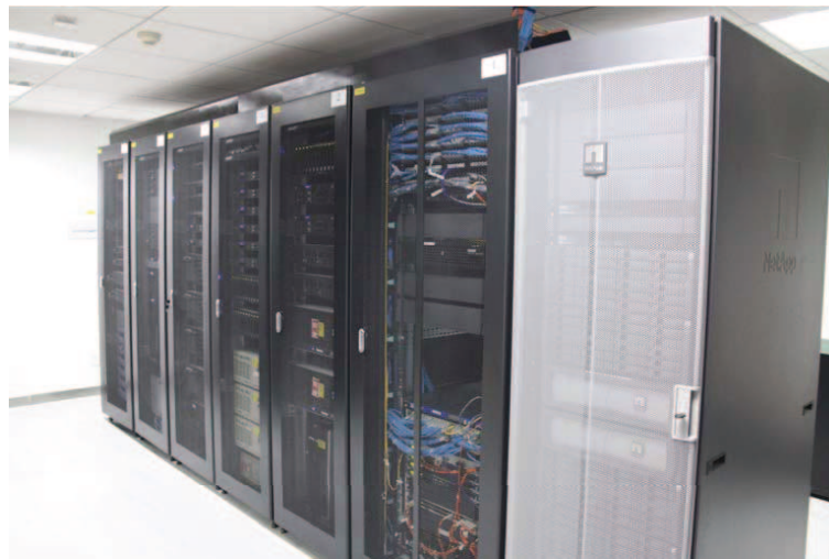
Figure 2. Shanghai VLBI Correlator.

A summary of the capabilities of the software correlator is presented in Table 1.