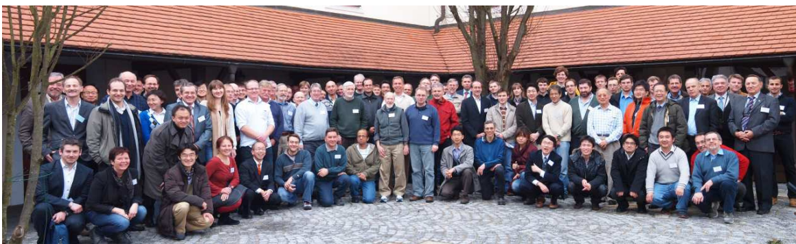
Figure 2. Participants of the VLBI2010 Workshop on Technical Specifications (TecSpec) held in Bad Kötzing, Germany in March 2012. More information about the workshop can be found at the URL http://www.fs.wetzell.de/veranstaltungen/vlbi/tecspec2012/index.html .