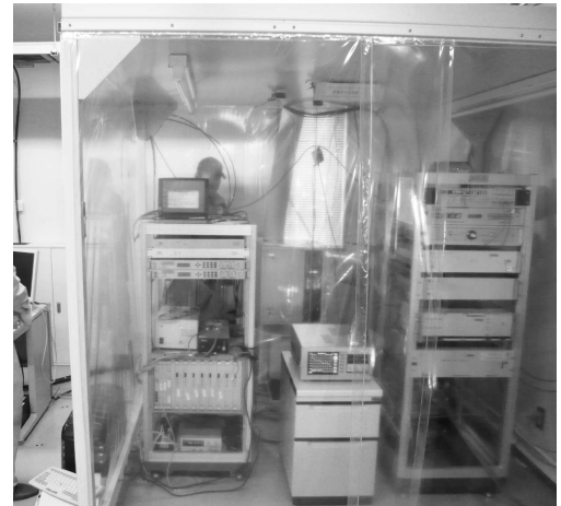
Figure 2. Precise temperature control box located at Kashima 11-m Station.

The original design of these antennas was identical. However, the frequency of the first local oscillator of X-H band at the Kashima 11-m station was changed by 80 MHz in 2008, so that the observation frequency range became the same as that of the Kashima 34-m station. A compact hydrogen maser atomic time standard was installed in November 2011. Since then the reference signal of the Kashima 11-m station has been provided from this frequency standard. Also, a precise temperature control box (PTCB: Figure 2) has been used since 2010 to keep the environmental temperature of the reference signal distribution unit, which is sensitive to temperature variation, constant. The PTCB can keep the air temperature variation in the box within a few tenths of degrees, while the room temperature around the PTCB varies in the range of a few degrees under the control of a standard air conditioner.