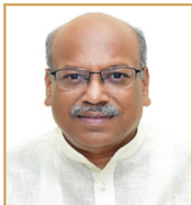
Sanjay Shamrao Dhotre Minister of State for Human Resource Development

India aspires to become a 5 trillion dollar economy in a near future. To reach this mark, it needs to evolve system and mechanisms to convert the present demographic dividend into high quality technical human resource, capable of doing cutting edge research and innovation, and deep-tech entrepreneurship. At this juncture, the MHRD's Innovation Cell and AICTE have brought out the 'National Innovation and Startup Policy 2019' for students and faculty.