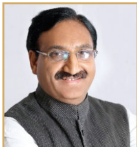
रमेश पोखरियाल 'निशंक' मानव संसाधन विकास मंत्री

स्टार्ट-अप इंडिया भारत सरकार की एक प्रमुख पहल है, जो नवीन आविष्कारों को हाथ में लेने, सहायता और प्रोत्साहनों के वित्त पोषण, उद्योग-शैक्षणिक भागीदारी और इन्क्यूबेटरों के बुनियादी स्तंभों पर आधारित है।