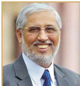
Anil D Sahasrabudhe Chairman, AICTE

I am very happy to see that the detailed guidelines have been issued by Ministry of Human Resource Development on National Innovation and Startup Policy for students and faculties of higher education institutions which further strengthens the Startup Policy released by All India Council of Technical Education in November 2016 from Rashtrapati Bhawan, just after few months of Startup action plan announced by the Government of India in January 2016.