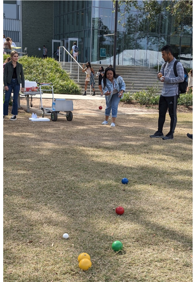
Students playing pétanque during Tulane's annual French Week, planned and run by graduate in French and Francophone Studies

High/Advanced Low proficiency levels defined by ACTFL. It prepares students for the Diplôme de français professionnel Affaires (niveau B2) delivered by the Paris Ile-de-France Chamber of Commerce and Industry.