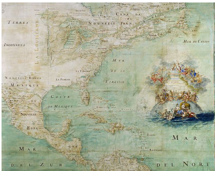
Map attributed to the Abbé Claude Bernou charting lands identified by Marquette and Jolliet while en route to Louisiana.